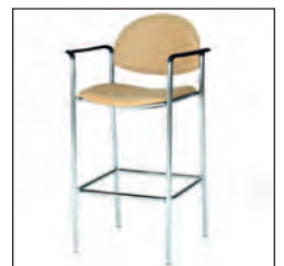
Alta Standard Stool - is a fine addition to the product line. The foot rest provides comfort while in the seated position.