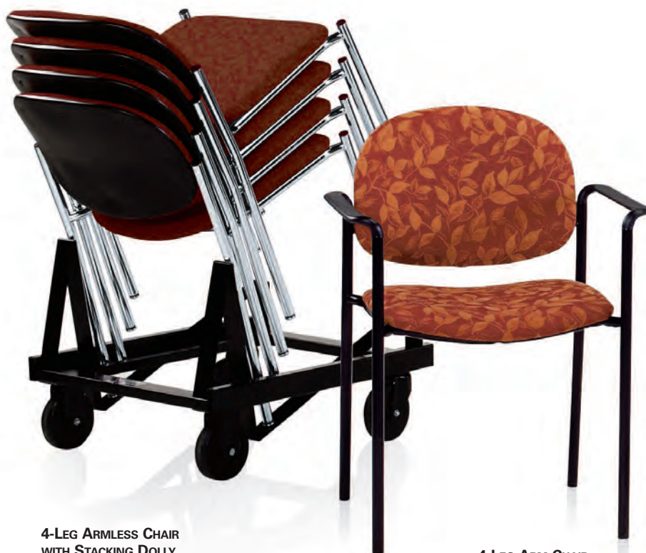
4-LEG ARMLESS CHAIR WITH STACKING DOLLY