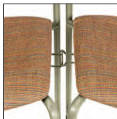
Seat Gangers - Steel wire gangers are available to meet the needs of ganging no arm chairs.