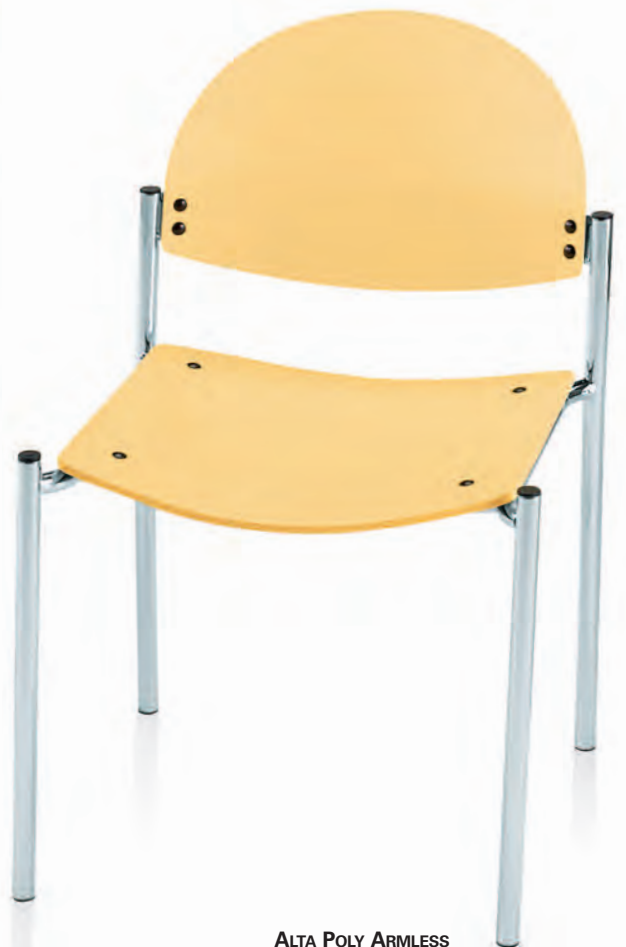
ALTA POLY ARMLESS