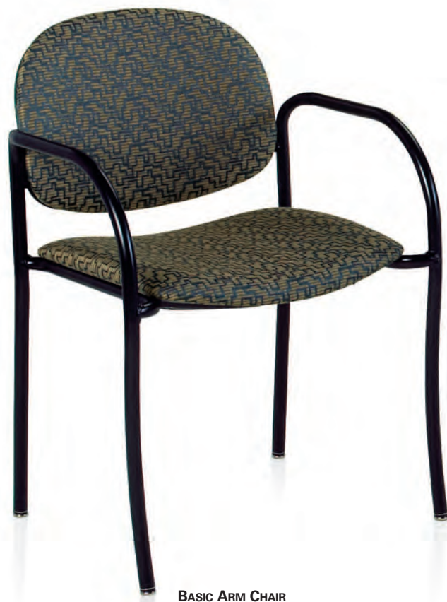
BASIC ARM CHAIR

Leg chair is stackable. Sled-base chair can not be stacked.