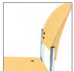
Back - Alta's compound curved back is made of 9-ply hardwood plywood.