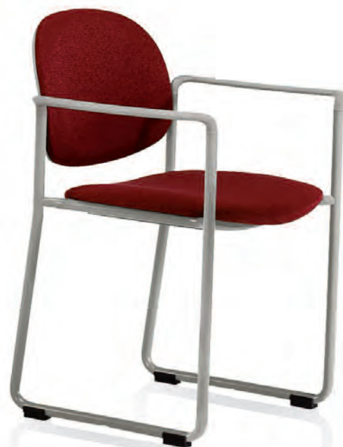
SLED-BASE ARM CHAIR