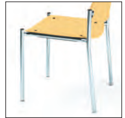
Kick-Back Leg - Wall saver leg design helps prevent any possible marring to the walls.

Alta is also available in an XL version, to provide comfortable seating for all individuals. Since people differ in size, their seating should too. Alta XL is built with 1" diameter tubing, using specialized, high strength steel. The Alta XL chair measures 35-3/8" wide (32" without arms), 25-1/4" deep and 37" tall. The seat is 30" wide and 20" deep. XL chairs can be stacked up to a maximum of 4 chairs high.