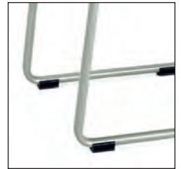
Glides - Rubber, non-skid glides work well on hard floor surfaces.

Leg chair is stackable. Sled-base chair can not be stacked.