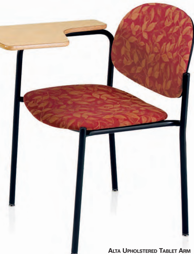
ALTA UPHOLSTERED TABLET ARM

Perfect for any educational setting, Alta Tablet Arm chairs are built to withstand the rigors of continuous use—people getting in and out, flipping the tablet up and down, pressing on the tablet when writing, as well as being moved around the room time after time.