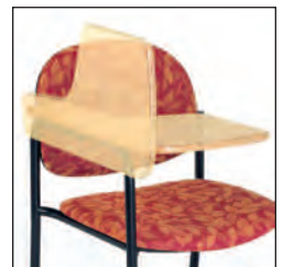
Flip-Top Tablet Arm - Allows for easy access in and out of the chair.