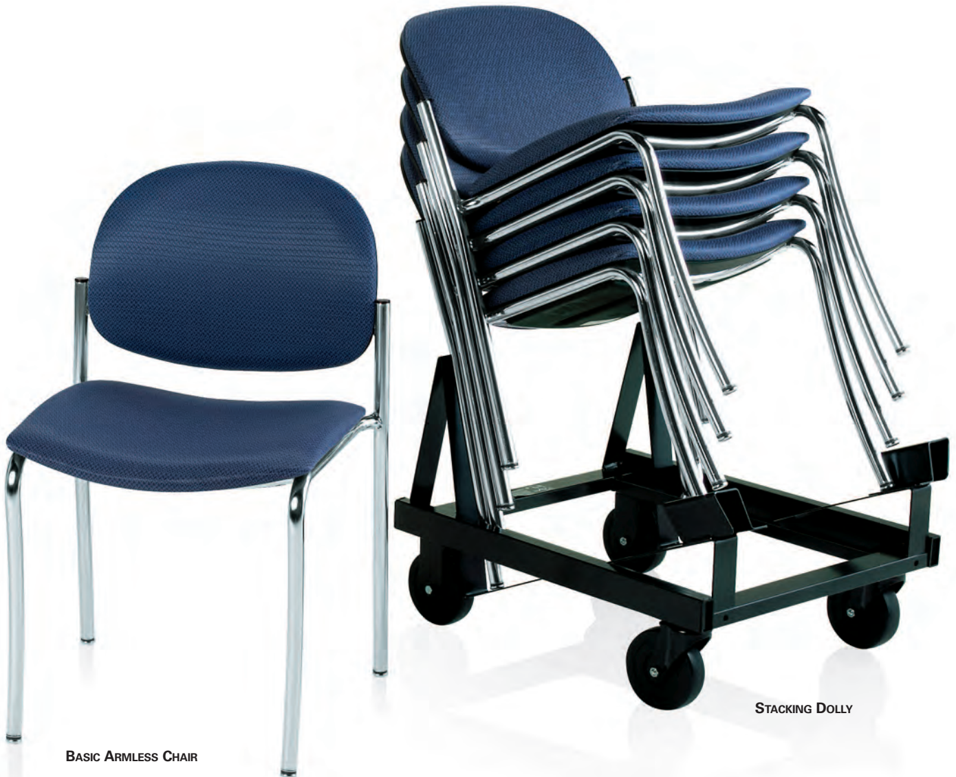
BASIC ARMLESS CHAIR