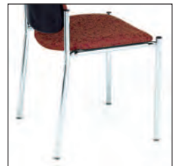
Wall Saver - Alta's wall saver leg keeps the chair from marring the wall.