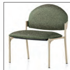
Alta XL - Oversized seating is available with or without arms. Approved for 24/7 use.