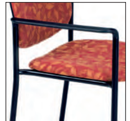
Arms - Nylon arms are available in several colors to help complement the frame colors.