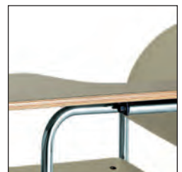
Tablet Arm Attachment - The tablet arm is welded to the frame providing necessary structural integrity.