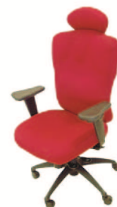
Standard Back With Headrest Option

Designed To Relieve Discomfort And Provide Relief